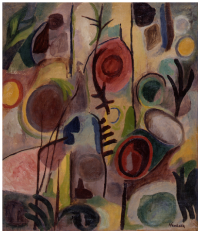
Garden 1951