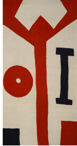
Sunlight Through Trees 2019 Matsumoto City Museum of Art, courtesy of Gallery TOM Stencil-dyeing (katasome) (detail) 2016 The Japan Folk Crafts Museum

Yunoki Samiro was a stencil dye artist who died in 2024 at the age of 101. Yunoki's works were a breath of fresh air in the world of stencil dyeing. With their unconstrained and humorous forms, they captivate viewers with their beautiful colours that harmonize pleasantly and are full of life. After encountering Yanagi Soetsu and others in the Mingei movement, Yunoki began his career as a dye artist under Serizawa Keisuke. Then he transcended the boundaries of genre to broaden his creative world into areas including illustration and collage. This exhibition is a look back at his 75-year career, and in addition to focusing on the theme of the cities and places that are connected to his work, it invites viewers on a journey through Yunoki's life. Yunoki's work, woven from his affection for the objects around him and the joy he finds in everyday life, shows us that the "now" is something to cherish, especially in times of change. Yunoki was a man who loved and enjoyed life, and with Mingei as its starting point, this exhibition allows visitors to enjoy the full breadth of his creative endeavours.