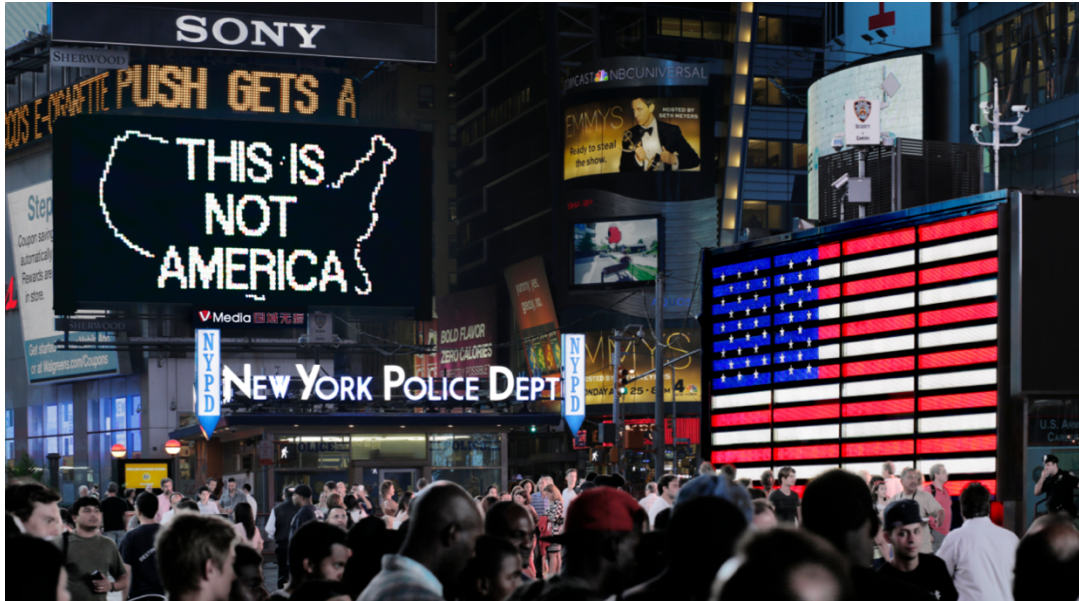
A Logo for America 1987/2014